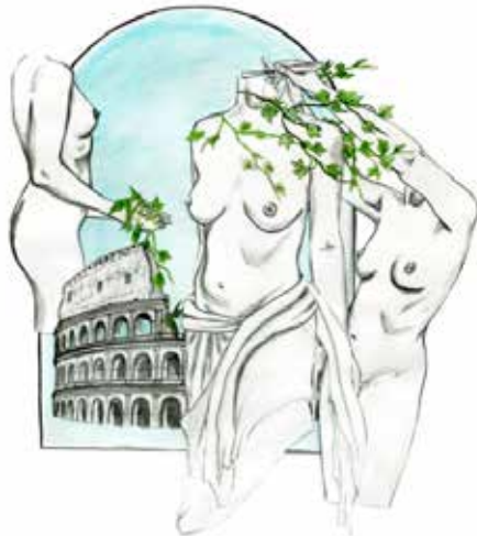
Chelsea Malia Brown, The Statue , 2022, water-soluble graphite, ink, and acrylic paint, 17" x 14"

This is the final art form of an existence cut and formed from Marble and Stone. And the Grecian creation asks why she could not be a watercolor painting of easy, flowing movement or stained glass of ever-changing bright color to see the sun without ache. But we subject matters have no say in our composition our medium our final form. We can only exist as we were meant to exist: as art.