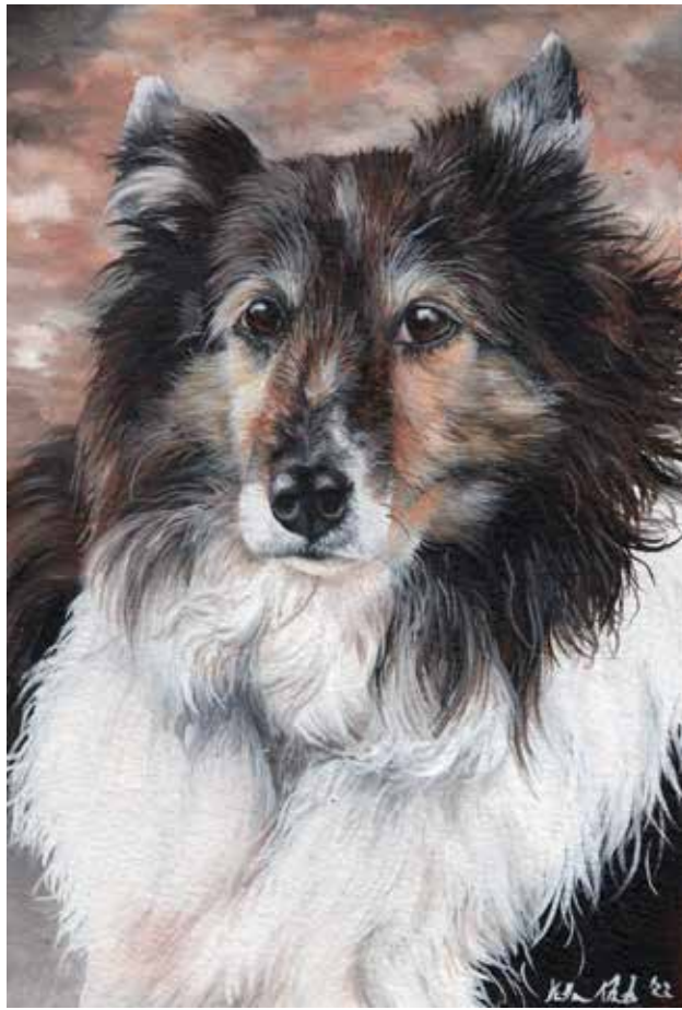
Katherine Klimitas, Lexie , 2022, watercolors, 5" x 7"

While her parents did all they could to make sure she was in mainstream classes, being treated like everyone else, there were many activities she couldn't do. Playing outside with the other kids wasn't an option so her mom was always looking for ways to keep her precocious youngster busy. When she was five, she gave her daughter an inexpensive watercolor paint set. It came in a plastic tray with a brush. She dipped her brush into water, onto the little oval cakes of color, and began painting. She found it was something she could easily do. And she liked it! Private art classes and summer art camps followed. By the time she was a teenager, she had explored acrylics, oils, mosaic, jewelry design, glassblowing, printmaking, and the list goes on.