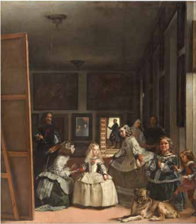
Diego Velázquez, Las Meninas , 1656, oil on canvas, 10' 5" x 9' 1"

to her only palace pets, the cucarachas (cockroaches), did the King, ever wooden, put up his hand to mask a smile.