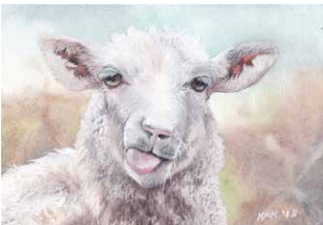
Katherine Klimitas, Sheep , 2018, watercolors, 6" x 8"

She would set up a still life, literally lay down on the floor with me, and we would draw. It used to be that if I drew what was in front of me and then picked up the drawing, it would be crooked. She would say, ‘no, it is twenty degrees off . . . see how this looks crooked?’ I wasn’t making the compensation. Now I do it automatically. So, she taught me how to draw and that’s really important when paintings are as realistic and detailed as mine. A good base is essential.” Klimitas’ medium of choice is watercolors because they are a relatively clean medium, dry quickly, no substrates or chemicals are needed, and once someone sets her up with the paints, water, and paper, she can work on her own, without any assistance. Although, occasionally one of her five dogs might lend a paw as she paints because they enjoy laying beside her as she works.