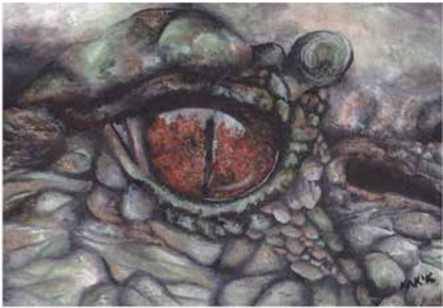
Katherine Klimitas, Alligator , 2016, watercolors, 6" x 8"

strangers united, singing in unison. Music can have a powerful effect on people, much like art. She believes, in a world where there is so much angst, artists of all sorts should strive to make their impact a positive one.