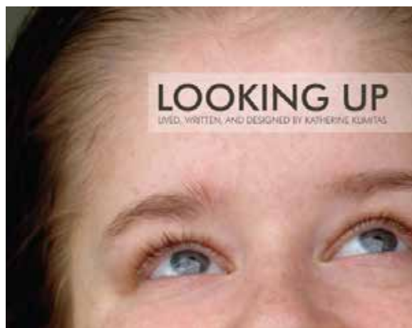
Cover of Klimitas' book, Looking Up , published by Arthur Hardy Enterprises, Inc. (2017)

and the importance of school inclusion. "If kids who are physically different are included in mainstream classes as much as possible at an early age, it not only benefits them, but also their able-bodied classmates. It teaches acceptance and tolerance, which in today's world, seems few and far between." Despite the physical challenges she has faced, she says, "feeling left out as a kid was the most difficult. Not be-