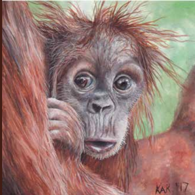
Katherine Klimitas, Baby Orangutan , 2017, watercolors, 6" x 6"