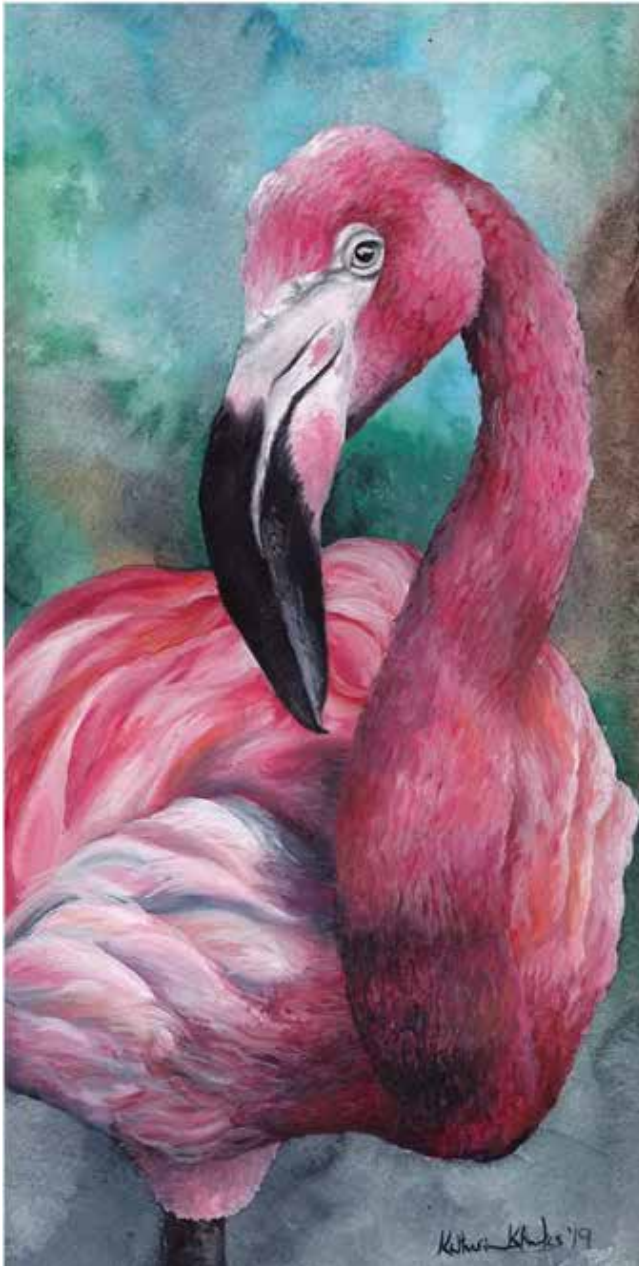
Katherine Klimitas, Flamingo , 2019, watercolors, 12" x 6"