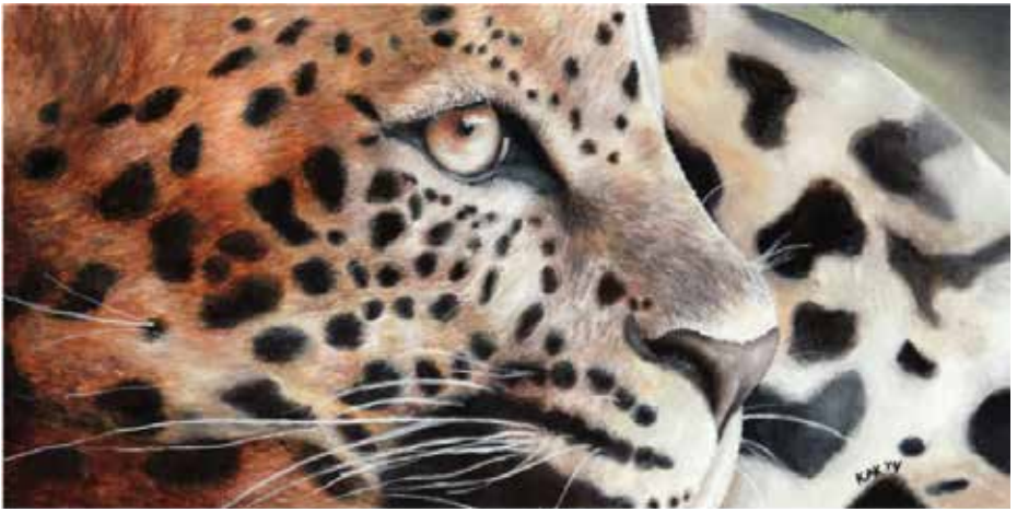
Katherine Klimitas, Leopard , 2014, watercolors, 12" x 6"